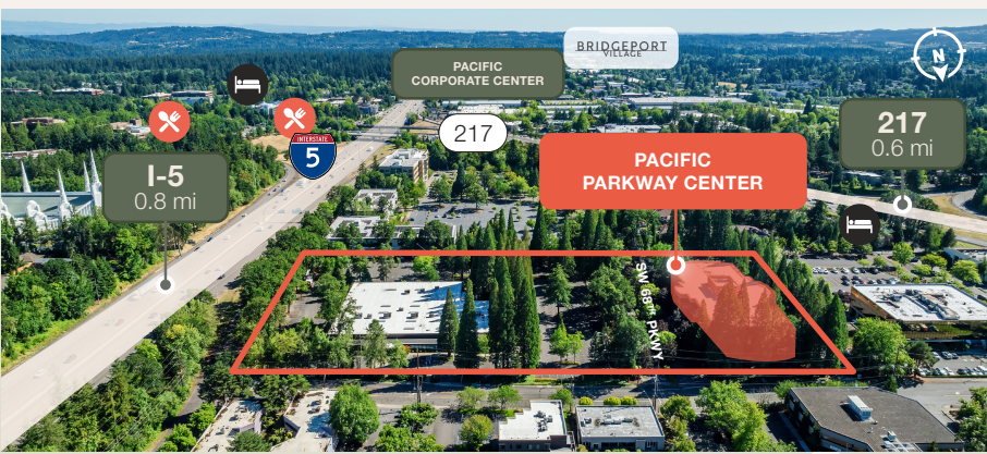
© 2024 PacTrust. All information supplied herein, including but not limited to measurements, dimensions, and specifications, is deemed reliable but is not guaranteed and should be independently verified. Any reliance on the information contained herein is at the user's own risk.